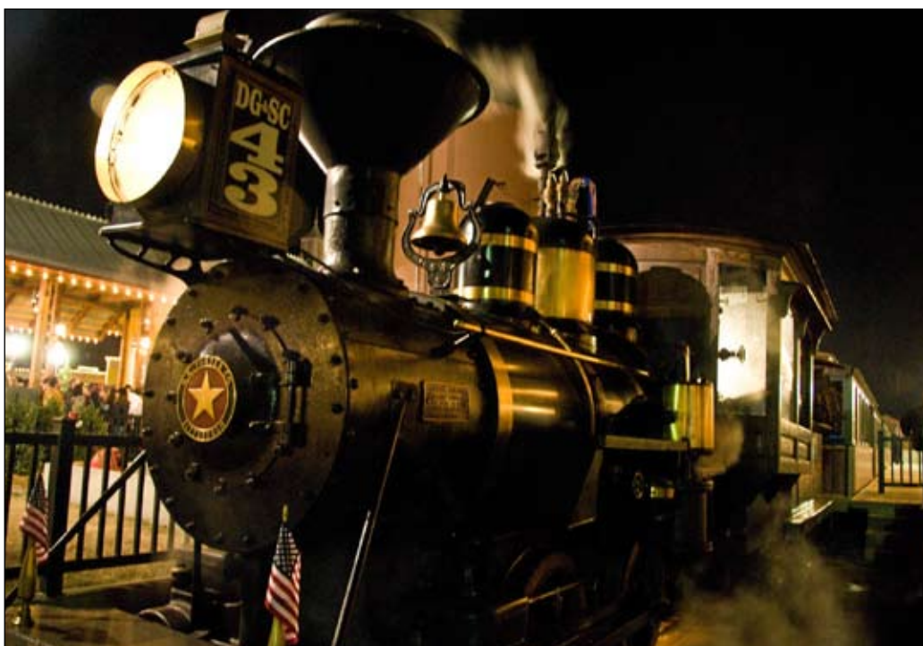
This 1943 narrow-gauge locomotive lets off steam at Christmas Train, a holiday program at Dry Gulch USA, Church on the Move's youth camp on U.S. 69 just north of Pryor.